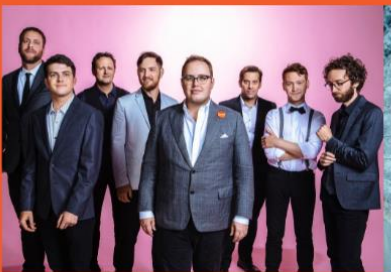
St. Paul & The Broken Bones